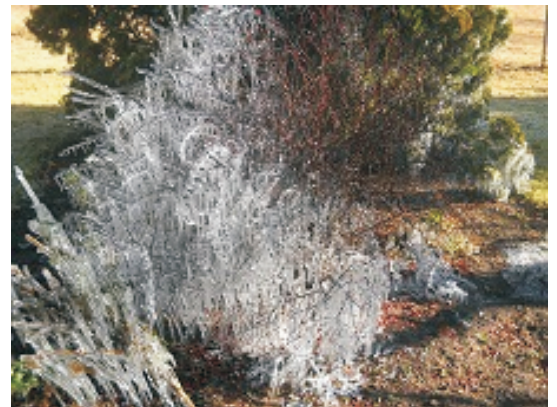
The Ice-Age visited TCC last week